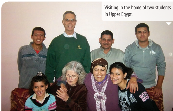
Visiting in the home of two students in Upper Egypt.