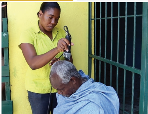
The ministry of the Good Samaritan Inn helps to protect or reinstate people's self-respect through offering haircuts, showers, and laundry facilities and by sharing the good news that they are children of God.