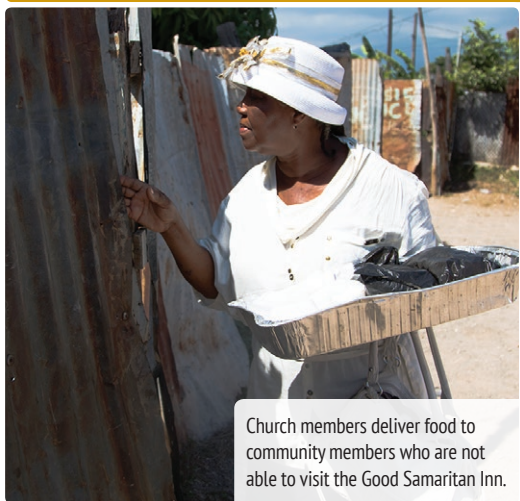
Church members deliver food to community members who are not able to visit the Good Samaritan Inn.