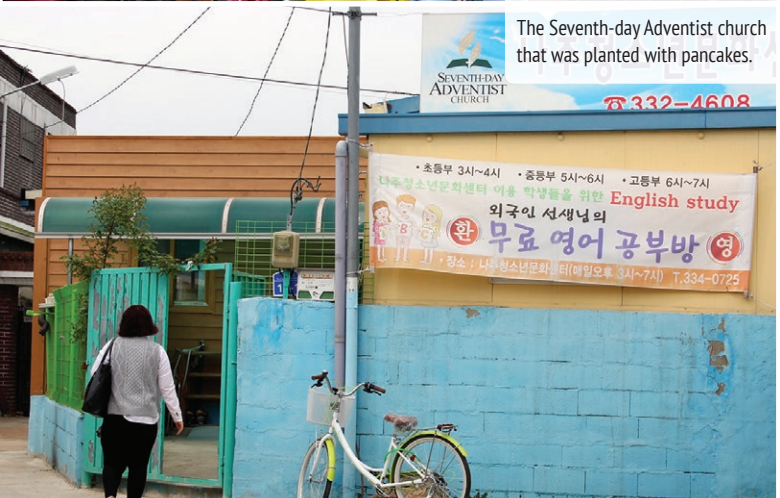
The Seventh-day Adventist church that was planted with pancakes.