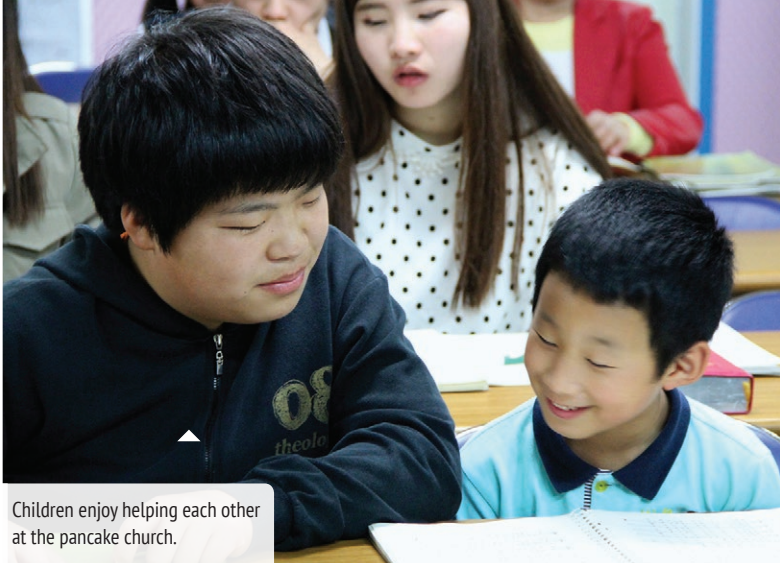
Children enjoy helping each other at the pancake church.