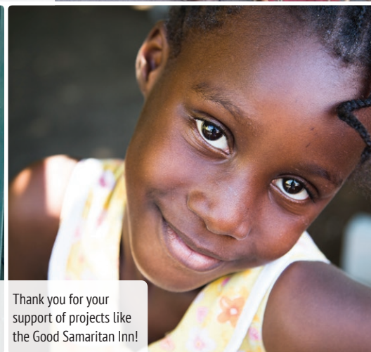
Thank you for your support of projects like the Good Samaritan Inn!